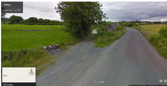
Image 1.2 - Google Maps dated July 2009