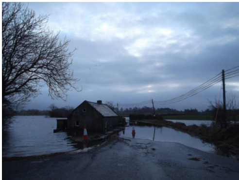
Image 1.1 - Abandoned Property in Front of Mr Forde’s House February 2014

Image 1.1 was, taken in February 2014, and illustrates the extent of flooding at the junction of the three local roads intersecting at Point A and the general location is shown as red circle in Figure 1.1 above. For clarity an extract from “Street View” on Google Maps has also been provided to show the lands in question (see Image 1.2 ). Both Images looking in a south-easterly direction from Point A to Point C (see Figure 1.1 )